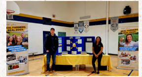
Outreach Update: Education events