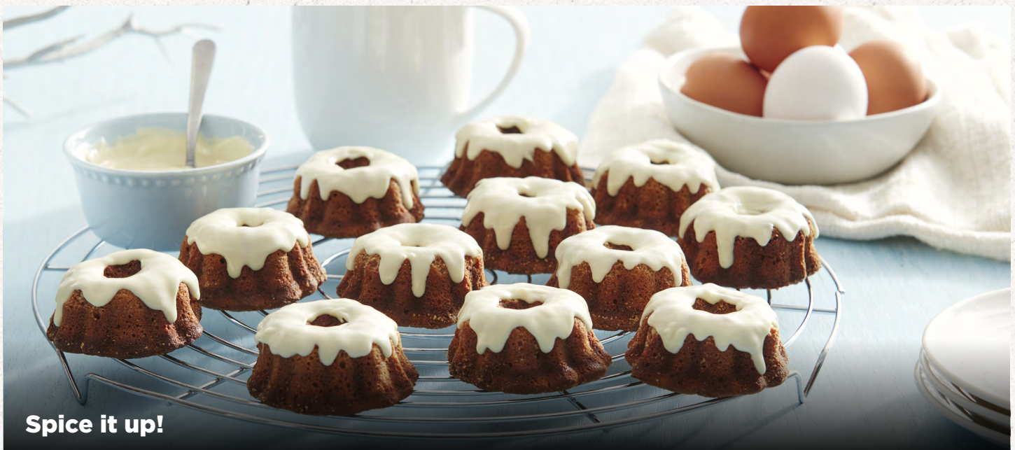
Spice it up!