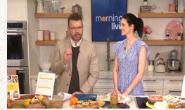
Nutrition Update: Healthy meals with less waste!