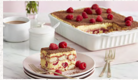
Recipe of the Month: Raspberry Lemon Tiramisu