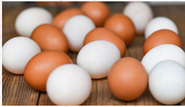
Industry Updates: FCC, OFA, PIC & more!